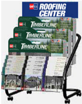
3 Pocket Waterfall 50"H x 28"W x 33"D Literature Pockets – 12 Qty. _____