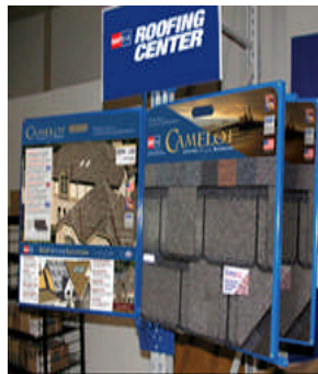
Swing Sample Board* 28"H x 52"W Literature Pockets - None Board Capacity – 6-12 Qty. _____