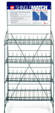
Paint Display 70"H x 32"W x 16 1/2"D 4 Tier Can Capacity - 160 Qty. _____