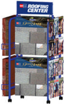
H-Frame 69"H x 33 1/2"W x 25 3/8"D Literature Pockets – 12 Board Capacity – 6 Hooks Qty. _____