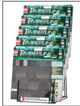
5 Pocket Folding 32 1/2"H x 17 1/2"W x 19 1/2"D Literature Pockets - None Qty. _____