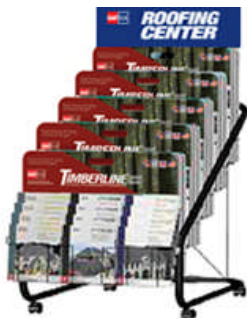
5 Pocket Waterfall 59"H x 28"W x 48"D Literature Pockets - 12 Qty. _____