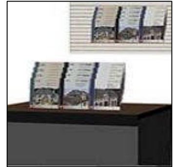
12 Pocket Literature Counter 15 1/4"H x 26 7/8"W Literature Pockets - 12 Qty. _____