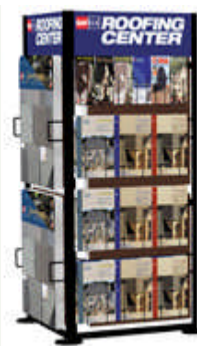
Zig Zag 60"H x 46"W x 28"D Literature Pockets – 12 Board Capacity – 6 Hooks Qty. _____